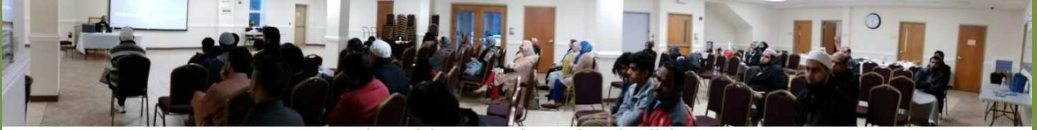
Signs of the Hour & the coming of Dajjal