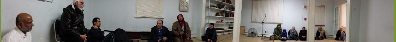
Honor awards (Hafs about Aasim)